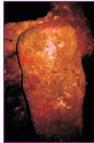
Plate 4 : Stone Pillar