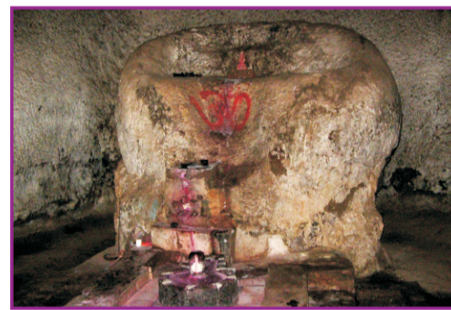
Plate 2 : Aundhaya Nagnath