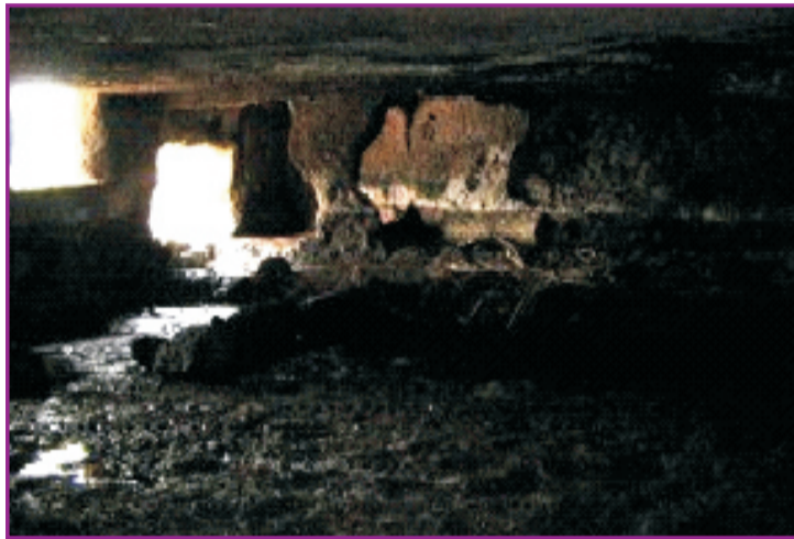
Plate 3 : Personal Meditation Rooms