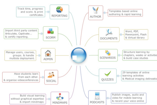
Figure 1. Dokeos features4

Dokeos serves wide features range of features apart from the basic requirements needed for any of such VLE software tool. Some of its features are shown in the Figure 1.