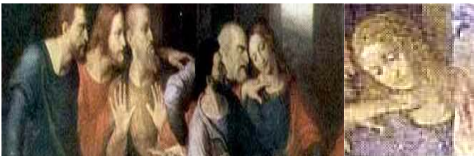
Fig. 3.5< http://en.wikipedia.org/wiki/file:The_Last_Supper >

At the heart of the novel is the story of the Da Vinci and the major clue is the most famous painting of 'Da Vinci's 'The Last Supper'. This painting is second painting by Leonardo Da Vinci after his worldwide known painting 'Mona Lisa'; this painting began in 1495 and finished in 1498. The painting