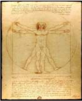
Fig. 3.4< http://en.wikipedia.org/wiki/file:Da_Vinci_Vitruve >

'The Vitruvian Man' is a Leonardo da Vinci's most famous drawing based upon the work of ancient Roman architect Vitruvius who was a proponent of using human proportion in building. Vitruvian Man is the most important clue in this novel's opening scene. The museum's curator Jacques Sauniere draws one pentacle on his body; he posed like the Vitruvian Man with cryptic message written beside his body. This position leads protagonist Robert Langdon near to the Leonardo da Vinci's other drawings. Here this drawing has been creating some suspense and wants some clearance about it. Ancient Roman architect Vitruvius described his idea in Book III of his treatise De Architectura. "This drawing is based upon human proportion. With some geometric descriptions and it exemplifies the blend of art and science. During the Renaissance and it shows Leonardo's keen interest in proportion the text has two parts, it was made as a study of the proportion of the male human body" as described by him.