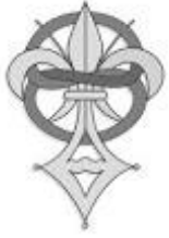
Fig. 3.1 < http://en.wikipedia.org/wiki/Priory_of_Sion >

Dan Brown's 2003's novel, The Da Vinci Code becomes world's bestselling novel in the same year 2003. After the publication of this novel people took interest in priory of Sion, Dan Brown indorses the mythical claims side of the priory of Sion, Brown Writes about the facts of 'The Priory of Sion' at the beginning of the novel,