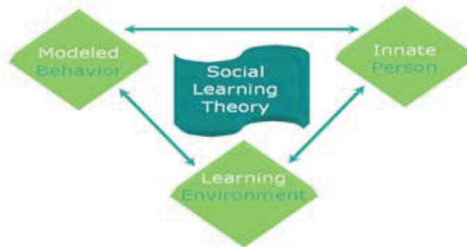
Fig-3. Social Learning Theory

The social cognitive principle has been widely employed to explain the television effects on a variety of social issues such as aggression, ethnic stereotypes, alcohol attitudes and behaviour. It also stresses the importance of viewer’s cognitive activities when consuming television messages. Any person’s socialization process is influenced by innumerable factors such as family, school, environmental factors etc. Direct experience and participation are important parameters which shape the youth’s impressions of the perceived structure of their environment. However, these forms of experience are usually limited to the immediate environment. Mass media, particularly television, plays a crucial role in bringing the outside world into homes.