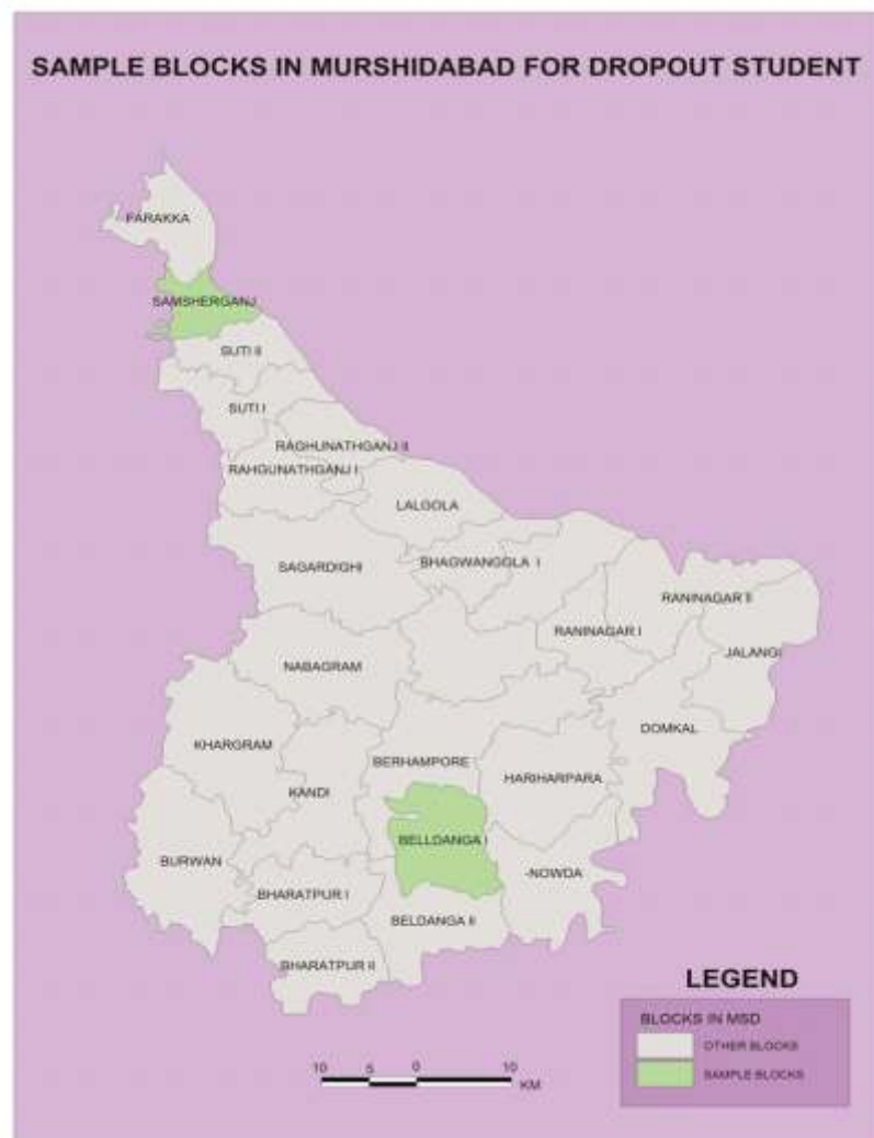
Figure No-01 Sample Blocks in Murshidabad District for Dropout Student