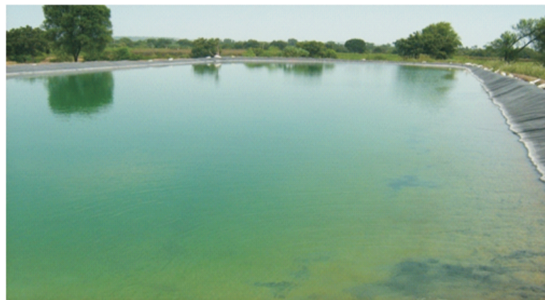
Farm pond at Kadwanchi watershed