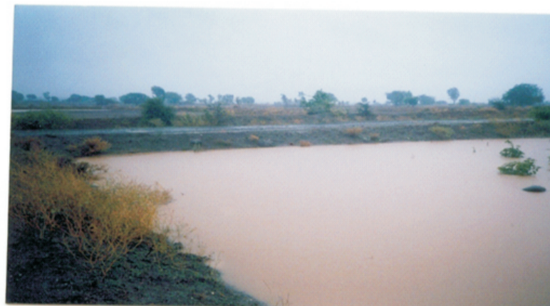
Farm pond at Kadwanchi watershed

4) Cropping pattern survey: The present cropping pattern and changes in yield due to watershed treatments activities were also collected from field survey. Data thus collected was then analyzed.