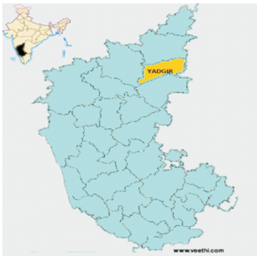
Location map of Yadgir District in the State