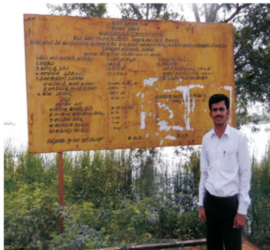
A view of General information of Khanapur Tank