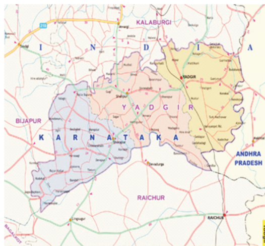
Map of Yadgir District Locating Khanapur