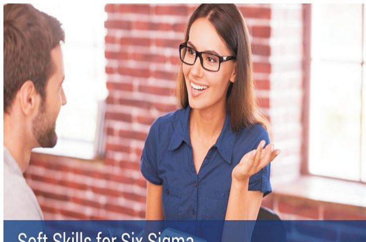
Soft Skills for Six Sigma Discover interpersonal skills that can help Six Sigma professionals

ince its inception at Motorola, six sigma has been widely adopted by many different types of organizations. The application of six sigma has still been the focus of study. In a world of intense competition, six sigma is considered to be an important management philosophy, supporting organizations in their efforts to obtain satisfied customers. Personnel and team that organizations select and assign to do the job as champion or sponsor is responsible to approve any conditions in the project, black belt is responsible to team leading, master black belt is responsible to coaching, audit, and training for black belt and green belt are the important basis of using this strategy because it affects the success or failure of the organization. Thus, human resource management roles are important as human resource planning, recruitment and selection, human resource development, performance appraisal, compensation and employee relations because of human performing strategy. Moreover, organizations should support the project with