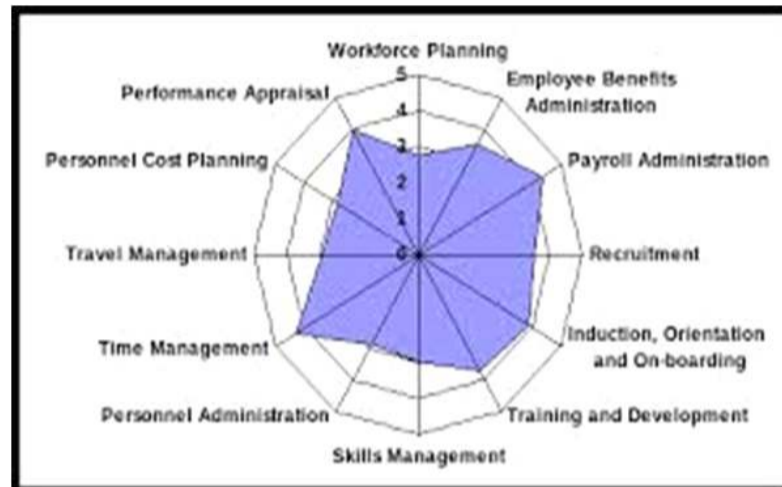
Figure 2: Overall benefits of HRIS