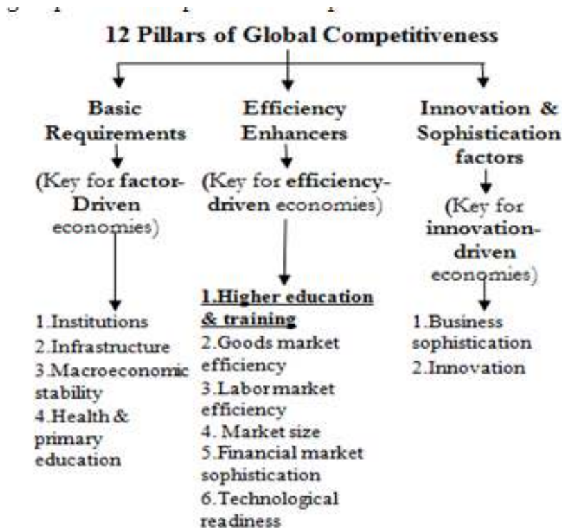
Fig.1: Pillars of Global Competitiveness

The Global Competitiveness Report assesses the ability of countries to provide high levels of prosperity to their citizens. This in turn depends on how productively a country uses available resources. There are three main stages of country development. These stages contain 3 sub-indexes and these are grouped into 12 pillars of competitiveness as shown below,