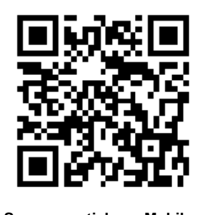
See your article on Mobile