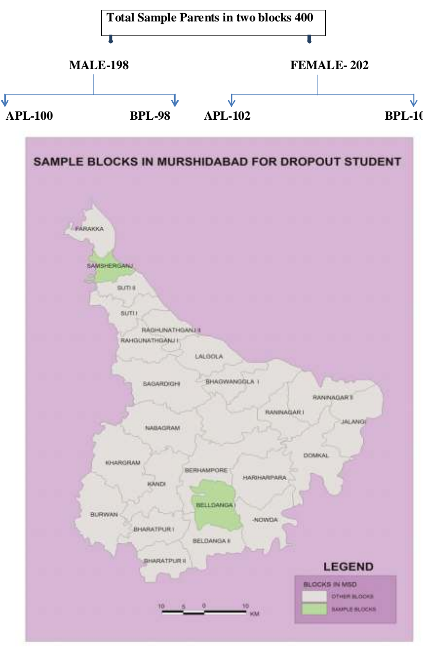
Figure No-01 Sample Blocks in Murshidabad District for Dropout Student

district, West Bengal were selected by stratified random sampling techniques. A total of 400 parents were selected by purposive random sampling method for the present study. The dependent variable of this study was – Attitude towards primary education. Independent variables were Economic status - BPL (Below Poverty Line) and APL (Above Poverty Line), and Gender. The sample flow-chart for the study was as below: